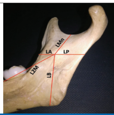
[Table/Fig-1]: Showing anthropometric location of lingula with respect to different mandibular landmarks. LA: Lingula to anterior border of mandibular ramus; LP: Lingula to posterior border of mandibular ramus; LB:Lingula to base of mandible; LMn:Lingula tocentre of mandibular notch; L2M: Lingula to alveolar socket of mandibular second molar tooth.

The present study also indicated bilingual distance between tips of lingula of both sides. Lingula ratio was calculated as distance measured from anterior aspect of lingula to anterior border of mandibular ramus divided by the width of the ramus [10]. Vernier caliper was applied for taking the reading nearest to millimeter (mm) for linear measurements and average of the two values was taken as final evaluation.