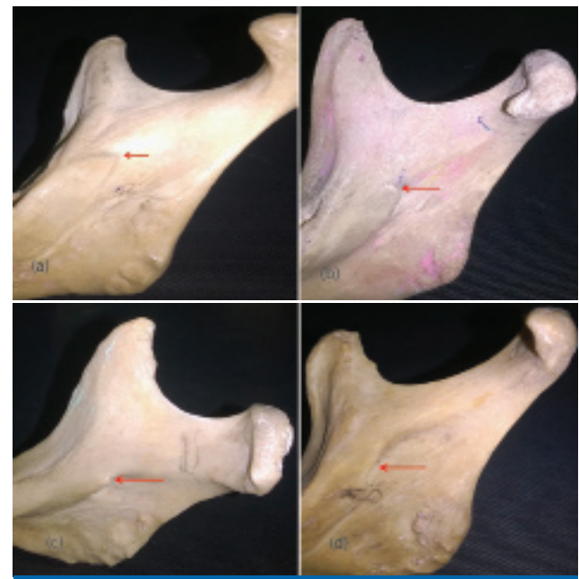
[Table/Fig-2a-d]: Lingula of different shapes-triangular (a), truncated (b), nodular (c) and assimilated (d).

Out of the four varieties, triangular type was most prevalent (51.39%), followed by truncated (23.61%) and nodular (20.83%) and assimilated (4.17%) as least prevalent type. Among, 72 sides, triangular shaped lingula were found in 37 sides (right - 20 and left -17), truncated lingula in 17 sides (right - 8 and left - 9), nodular shaped lingula in 15 sides (right -7 and left - 8) and assimilated type lingula in 3 sides (right - 1 and left - 2). Lingula was bilaterally symmetrical in shape among 14 (38.9%) mandibles. In case of triangular shaped lingula, bilateral involvement was observed in eight mandibles, whereas, bilaterally truncated lingula were found in three mandibles. But none of the mandible showed bilateral occurrence of assimilated type lingula though bilateral nodular shaped lingula were found in another three mandibles [Table/ Fig-3&4]. We also noted that the margins of some foramina were thicker as compared to others. On doing comparison between right and left sides, no statistical significance was found between lingula of various shapes (Chi-square value=0.702, df=3, p=0.87).